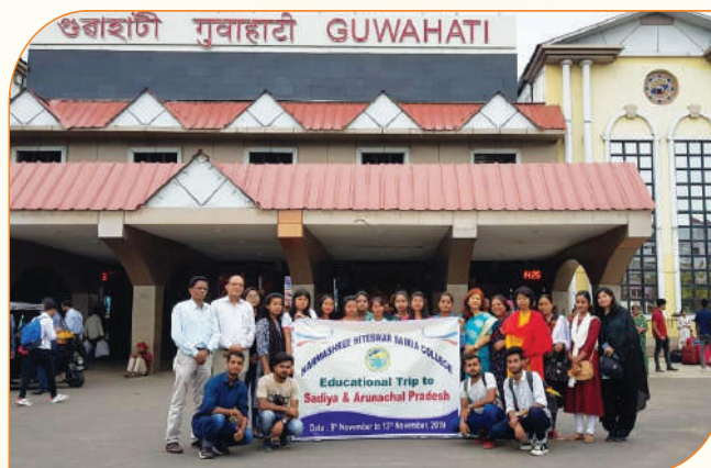
Students and teachers in field-trip

experience and exposure. Excursion help in building friendly relationship between teachers and students which is an essential condition for a healthy teaching and learning process.