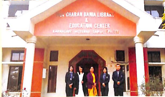
Training Programme for the USTM students from 20 th January to 2 nd February

2. Training programme to Indira Gandhi Open University's students organised by Uma Charan Bania Library and Education Center, Karmashree Hiteswar Saikia College from September 2022.