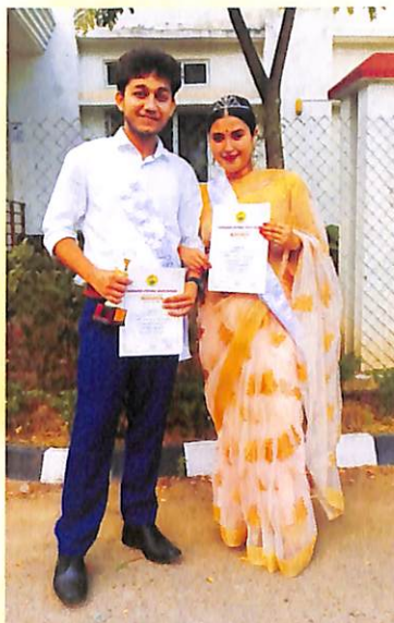
Mr. & Ms. Karmashreean 2022